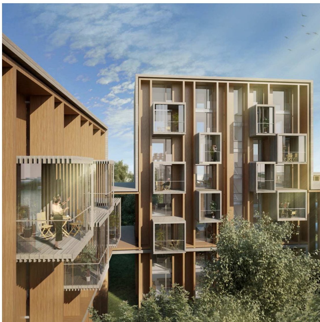
Figure 1 The external shear walls of impregnated LVL express confidently the structural integrity and the flexibility of the layout to the outside

Our design starts with the dynamic line of the tree, growing from a solid base upwards. A strong trunk is feeding the branches for future growth.